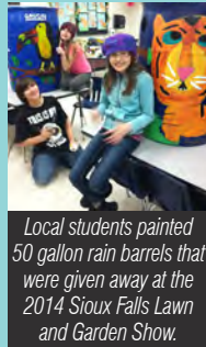
Local students painted 50 gallon rain barrels that were given away at the 2014 Sioux Falls Lawn and Garden Show.

The Big Sioux River is currently one of the sources of municipal drinking water for the City of Sioux Falls. Maintaining water quality of the river helps to lower costs needed to meet drinking water quality standards.