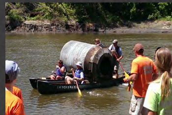
Volunteers pulled out a pig feeder from the Big Sioux River during Project AWARE

Project AWARE, which stands for A Watershed Awareness River Expedition, is the Iowa Department of Natural Resources' (DNR) annual volunteer river cleanup event. In addition to cleaning trash out of the river, participants learn about watersheds, water quality, recycling, and other natural resource topics. 2014 marked the 12th year of Project AWARE and it offered a unique opportunity for a South Dakota/Iowa partnership as it was focused on cleaning up 91 miles of the Big Sioux River starting just south of Sioux Falls, South Dakota. A total of 388 participants helped to remove 28.8 tons of trash from the Big Sioux River during the week-long event with 95 percent of the trash recycled. More than 75 partnering organizations worked to make the event a success and the City of Sioux Falls was recognized as a Platinum Paddle sponsor for the event.