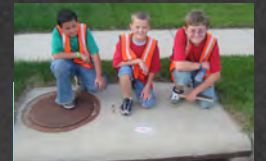
Local area boy scouts help to install curb markers on storm drains.